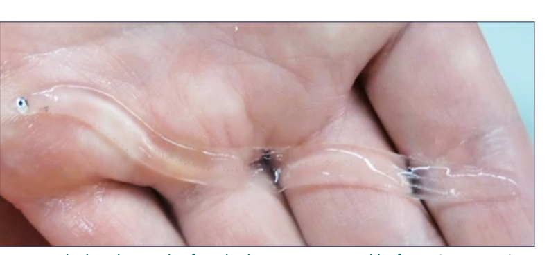
A baby glass eel, after the larvae stage and before pigmentation. Peabody Museum of Natural History, Yale University, USA.